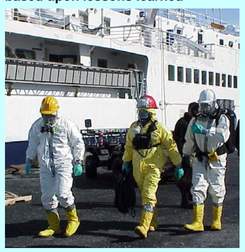
Seward Vessel Hazmat Drill - March 2004

Periodically test your plan and modify based upon lessons learned