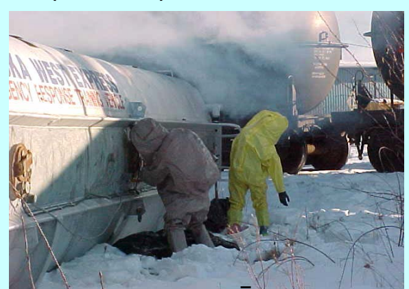
Fairbanks Hazmat Drill – Feb 22, 2003 Simulated Railcar/Truck Accident