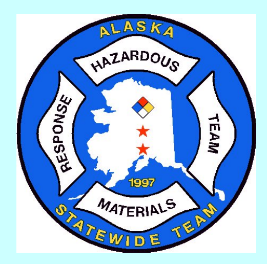
What is the Statewide Hazardous Materials Response Team?

The Statewide Hazmat Team is composed of several teams capable of deploying to any location in the State to respond to a Hazmat release. The Team is 'Level A' capable (i.e., the highest level of capability for response). The Teams are based in Anchorage, Fairbanks, Kodiak, and Valdez and are available for callout through the Alaska Department of Environmental Conservation. The teams are available for emergency response only, and not for cleanup and recovery operations. Once the emergency phase is terminated, the teams will be returned to their location of origin.