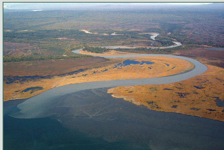
NCI-04 Beluga River looking north.