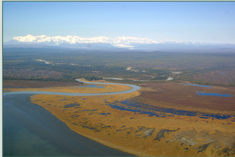
NCI-04 Beluga River looking west.