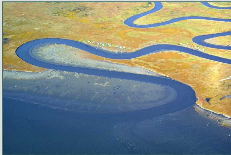
NCI-07-02 Ivan River looking north.