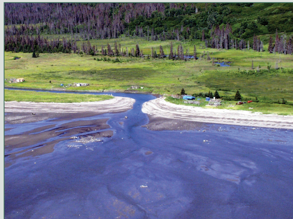
Polly Creek, CCI-13-01 as viewed from the East.