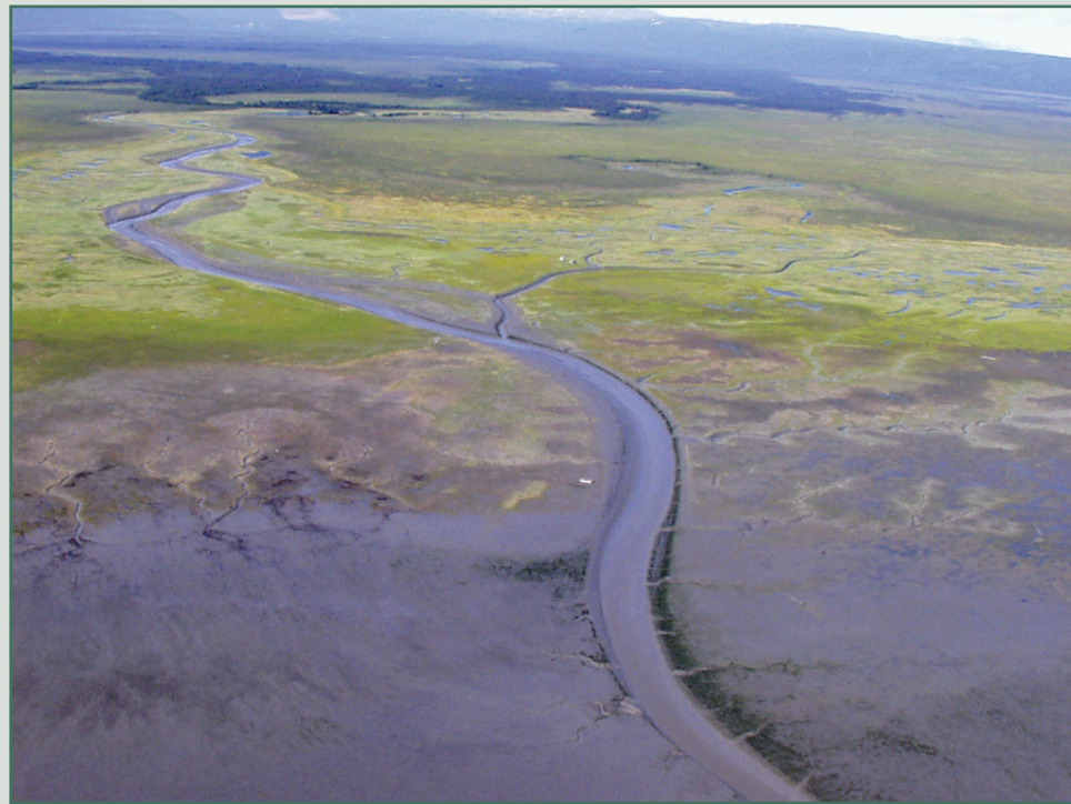
Middle River, CCI-21-01 as viewed from the Southeast.