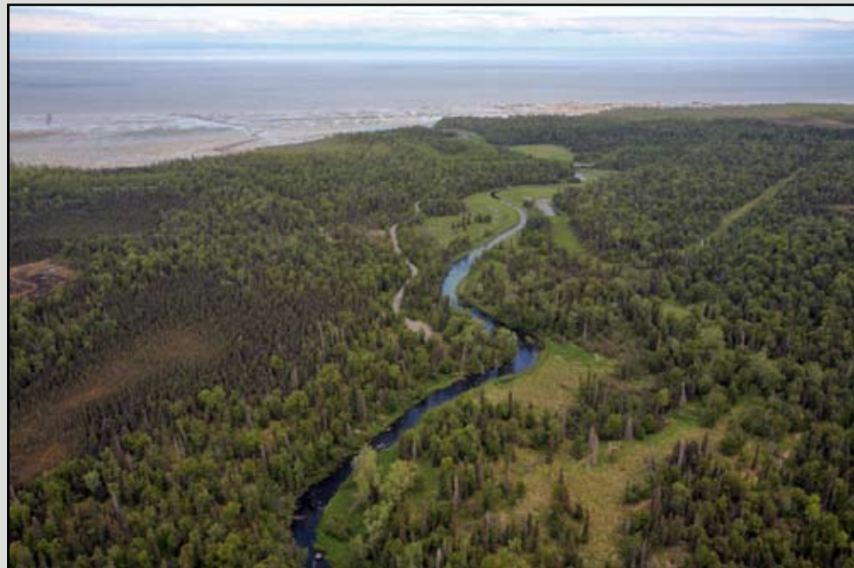
CCI-27, Swanson River Canoe Retrieval Site, Mile 1.5, as viewed from the south.