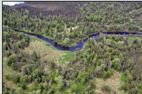
CCI-27, Swanson River Canoe Retrieval Site, Mile 1.5, as viewed from the east.