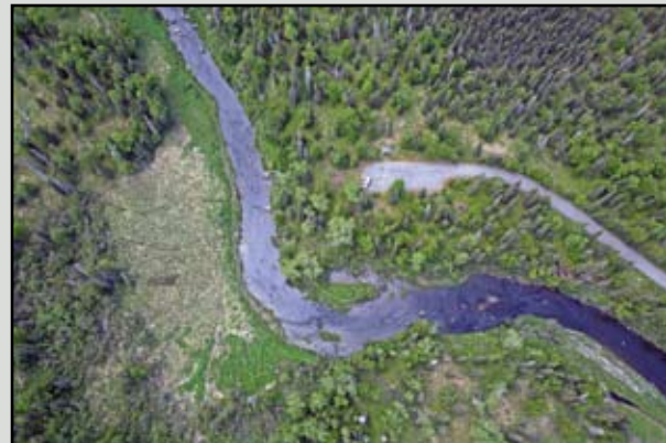
CCI-27, Swanson River Canoe Retrieval Site, Mile 1.5, as viewed from above.