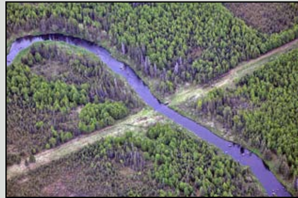
CCI-28, Swanson River Pipeline Crossing, Mile 6.8, as viewed from the northeast.