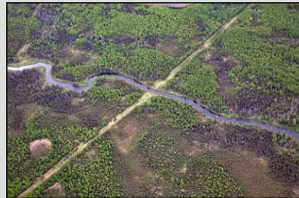
CCI-28, Swanson River Pipeline Crossing, Mile 6.8, as viewed from the east.