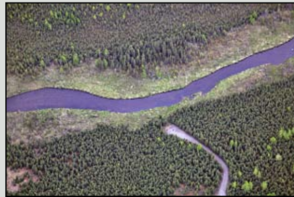
CCI-29, Swanson River Mile 18.5, as viewed from the northeast.