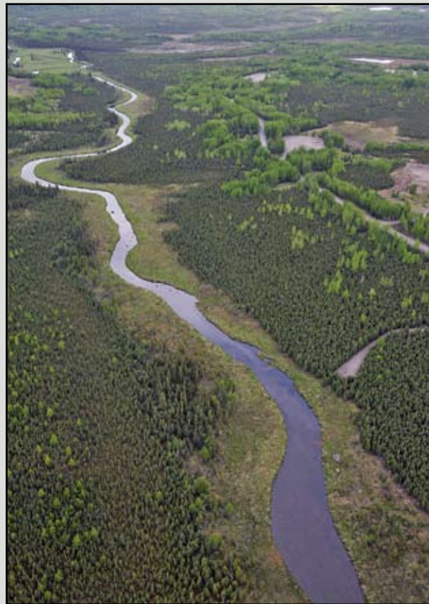
◀ CCI-29, Swanson River Mile 18.5, as viewed from the southeast.