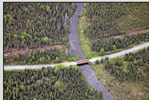
CCI-32, Swanson River – North Bridge, Mile 22.7, as viewed from the south.