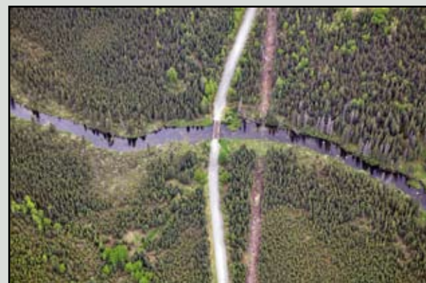
CCI-32, Swanson River – North Bridge, Mile 22.7, as viewed from the west.