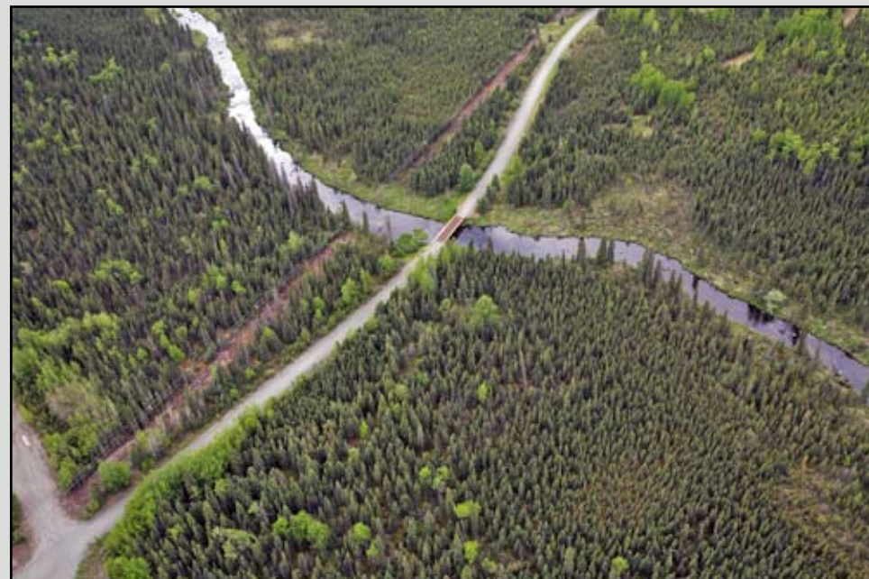
CCI-32, Swanson River – North Bridge, Mile 22.7, as viewed from the northeast.