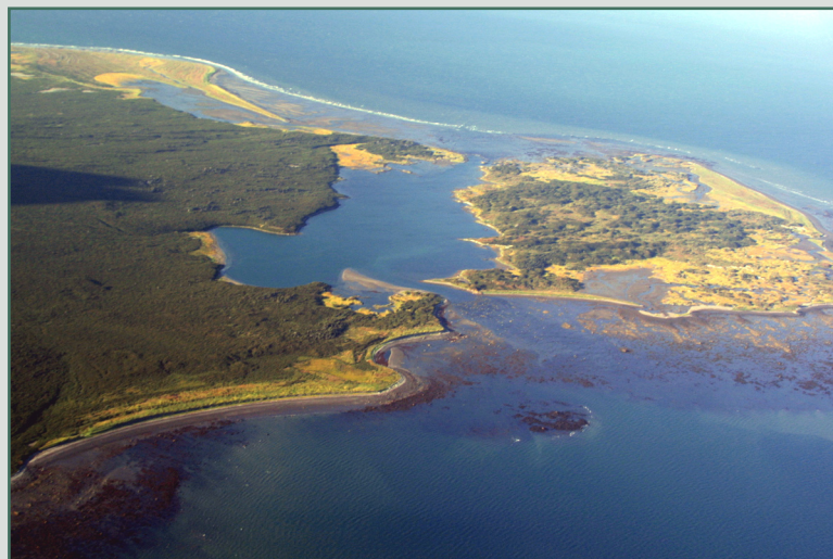
SWCI-09 Augustine Island-west looking south.