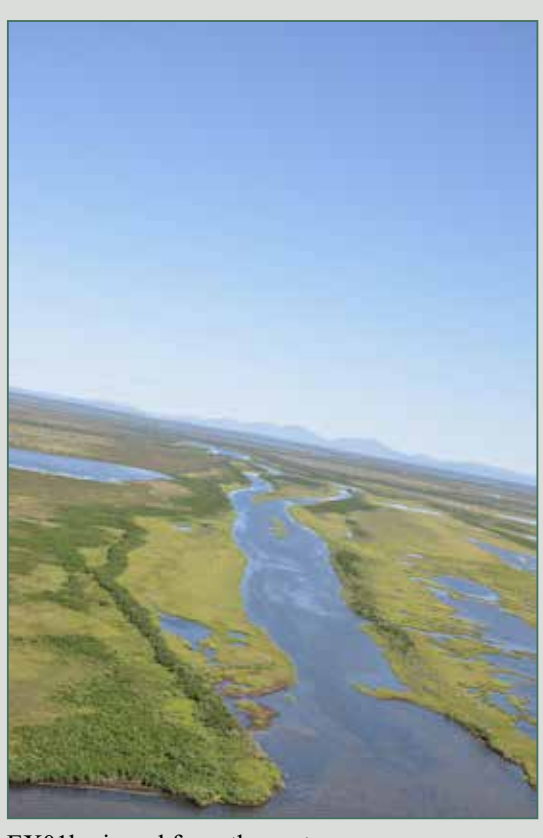
EX01b viewed from the east.