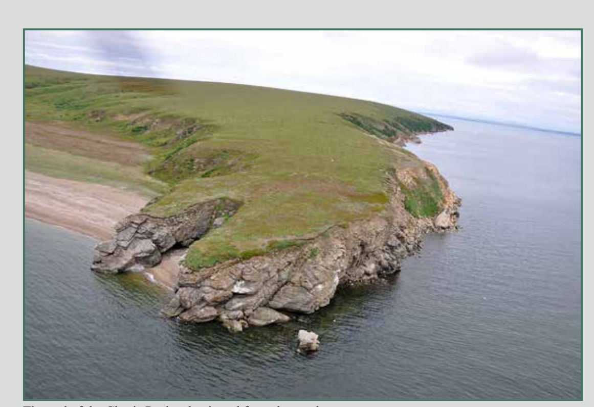
The end of the Choris Peninsula viewed from the south.