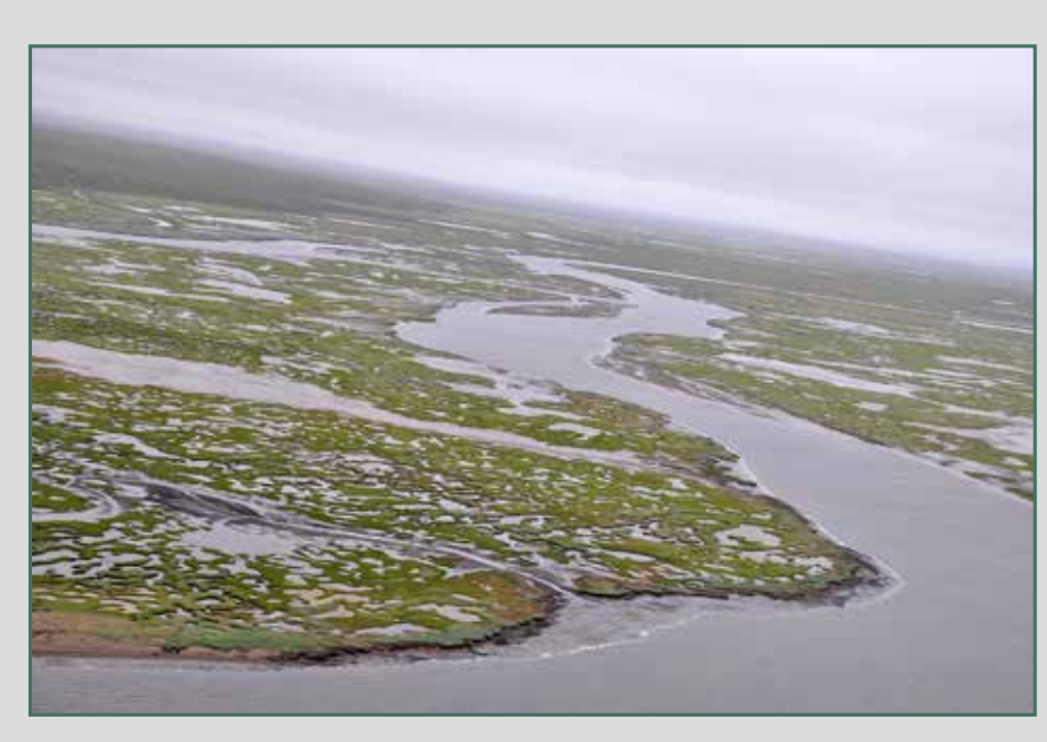
EX01b viewed from the north.