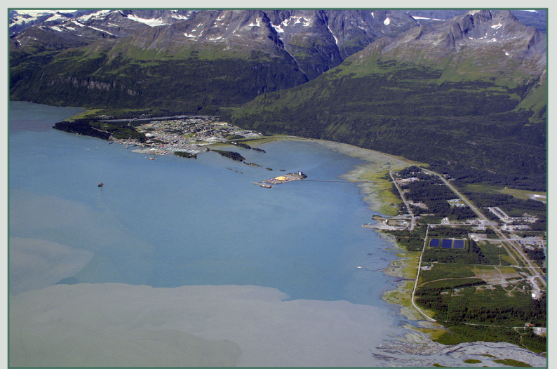
PWS NE-17 Valdez Duck Flats looking northwest.