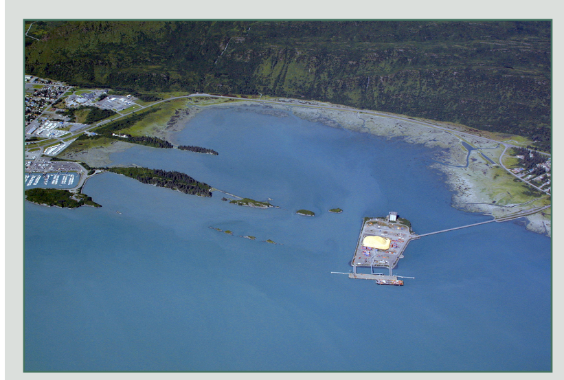
PWS NE-17 Valdez Duck Flats looking north.