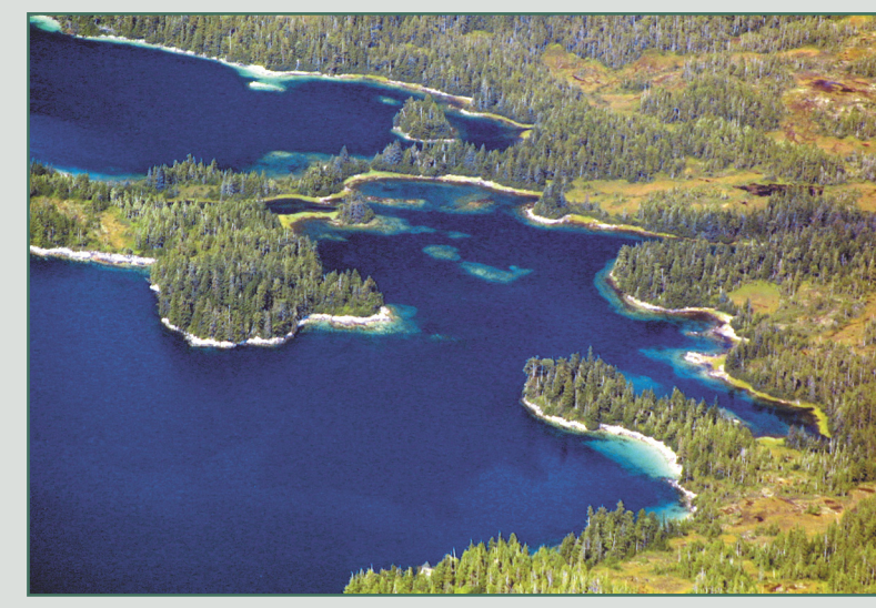
PWS-NW13 Fairmount Bay Lagoon looking northeast.