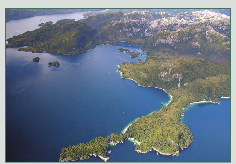
Fairmount Bay looking north.