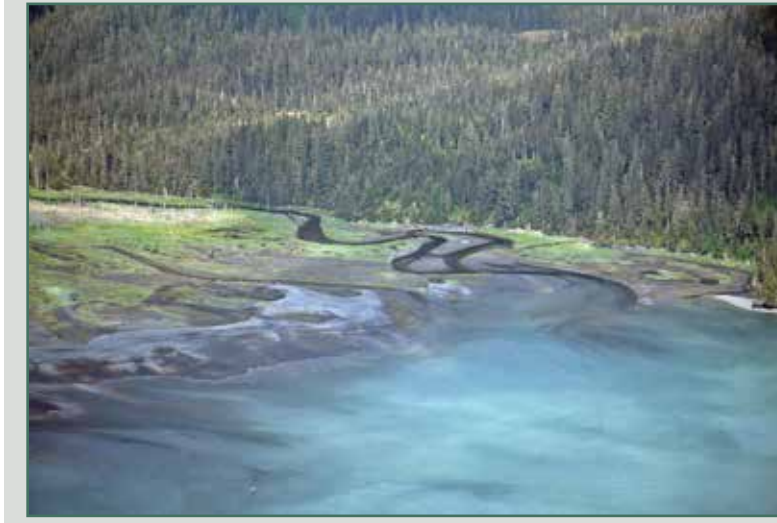
PR02c viewed from the southeast.