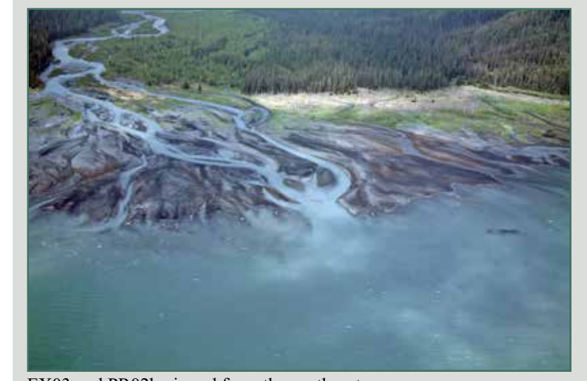
EX03 and PR02b viewed from the southeast.