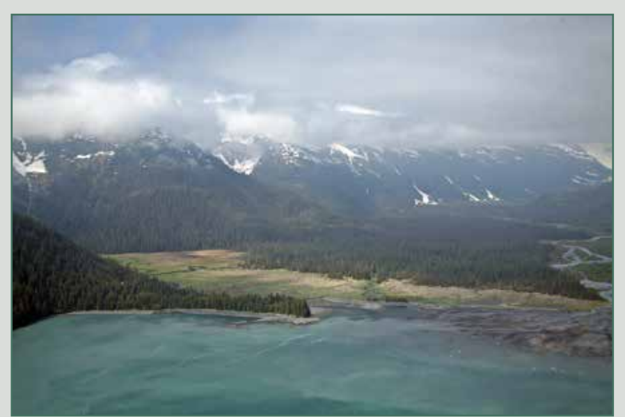
PR02a viewed form the northeast.