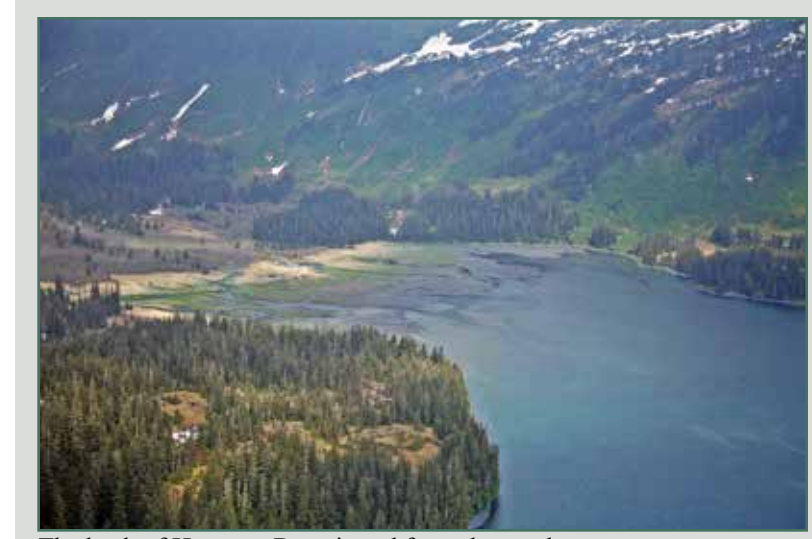
The back of Hummer Bay viewed from the southeast.