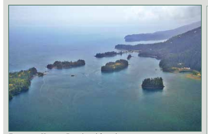
Entrance to Hummer Bay viewed from the west.