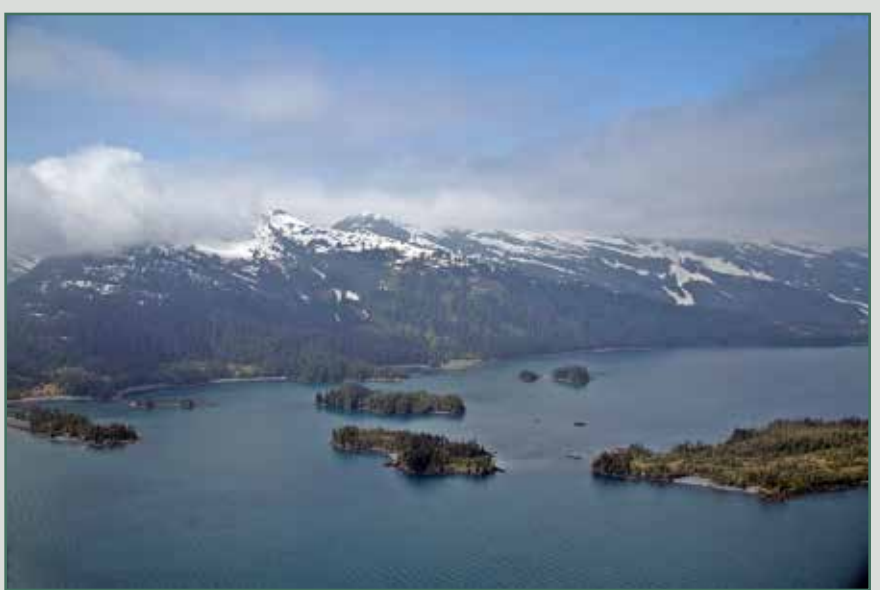
Entrance to Hummer Bay viewed from the northeast.

Free-oil Containment and Recovery, Shallow Water