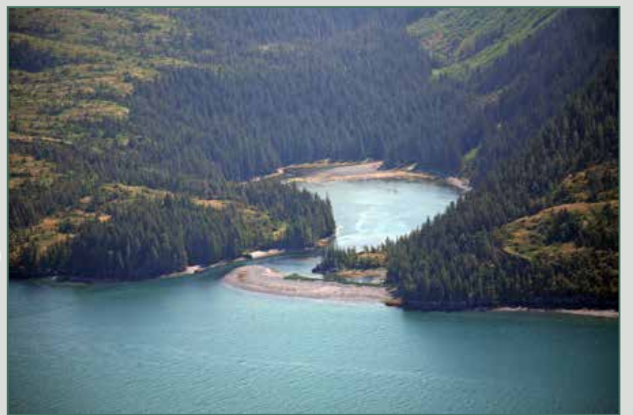
EX02a viewed from the west.