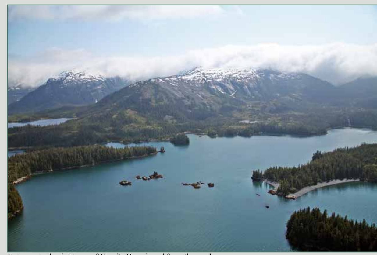
Entrance to the right arm of Granite Bay viewed from the north.