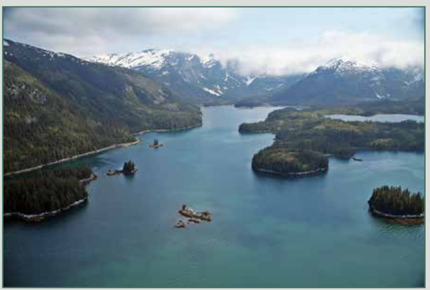
Entrance to Granite Bay viewed from the west.