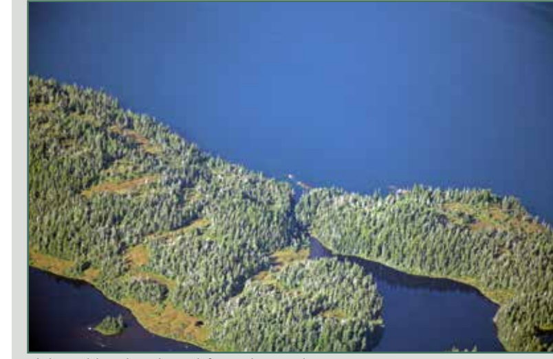
Fish Ladder site viewed from the northeast.