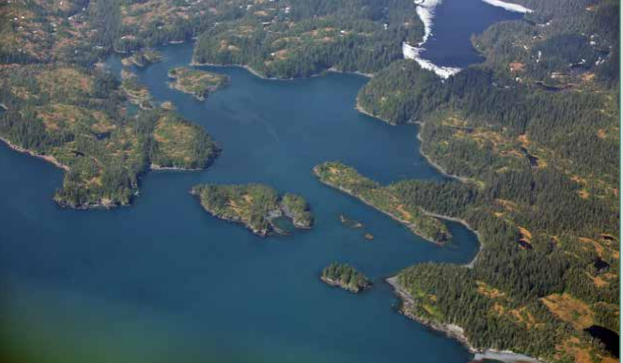
Surprise Cove viewed from the northeast.