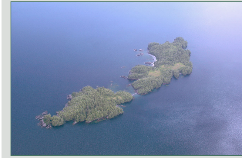
NW-01 Little Axel Lind Island viewed from the northwest.