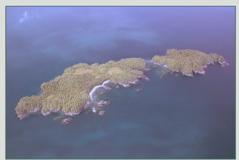
NW-01 Little Axel Lind Island viewed from the southeast.