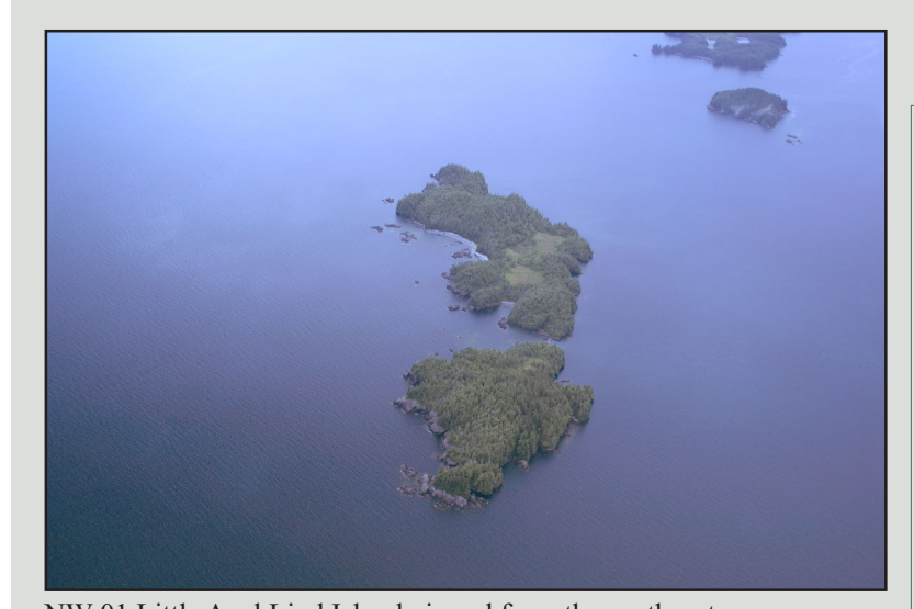
NW-01 Little Axel Lind Island viewed from the northeast.