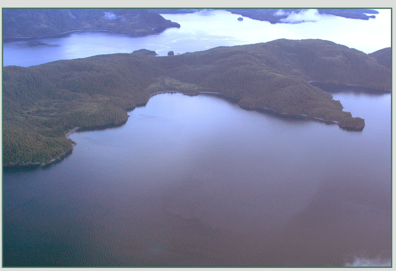
NW-03-02a, 02b and 03a Storey Island viewed from the north.