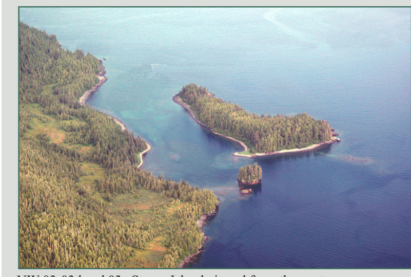
NW-03-03d and 03e Storey Island viewed from the west.