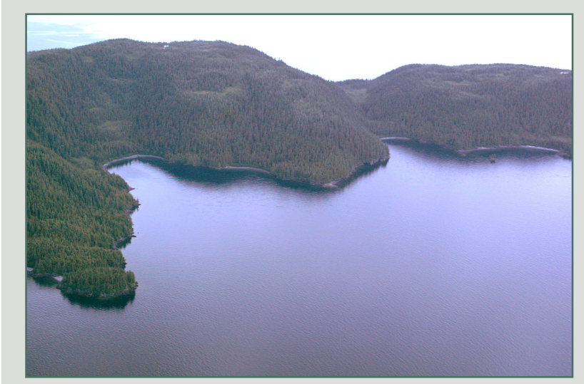
NW-03-03b Storey Island viewed from the north.