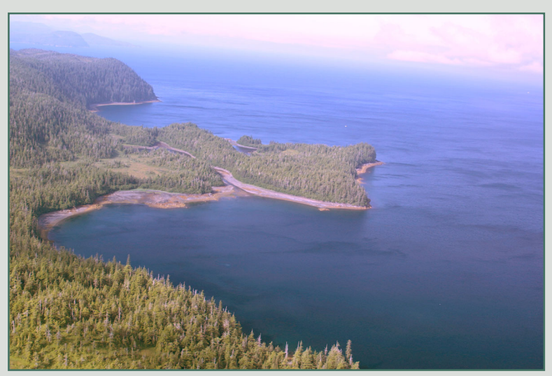
NW-05-02a Outside Bay lagoon viewed from the northeast.