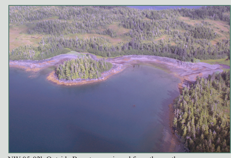
NW-05-02b Outside Bay stream viewed from the south.