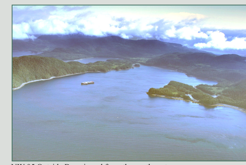
NW-05 Outside Bay viewed from the southwest.