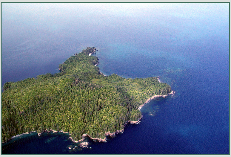
NW-07 North Lone Island viewed from the east.