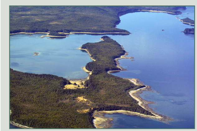
SE07-03-03a-h Looking north over Couverden Island.

SE07-03-02a Looking north at the salmon stream at the head of Swanson Harbor.