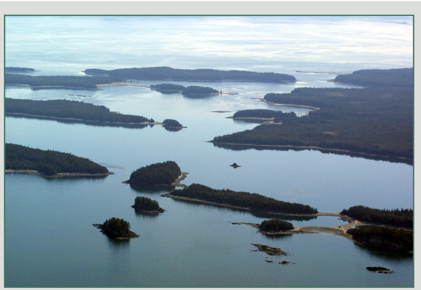
SE07-03-02b and 03a-e Looking southwest into the cove behind Couverden Island.