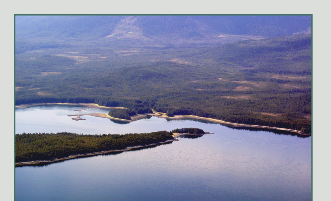
SE07-03-02b Looking west at the east entrance to the cove behind Couverden Island.