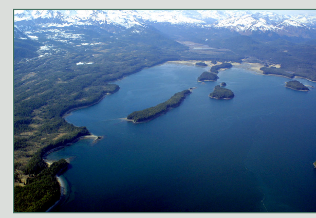
SE07-05 Looking northwest in St. James Bay.

SE07-05-02d Overlooking the stream at the mouth of St. James Bay.