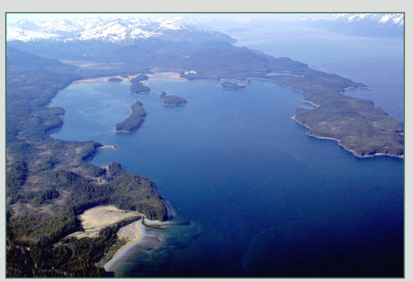
SE07-05 Looking north into St. James Bay.