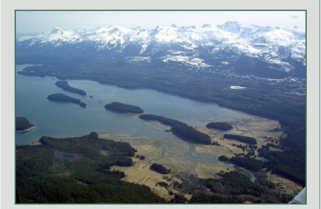
SE07-05 Looking southwest at the Lynn Brothers Islands.