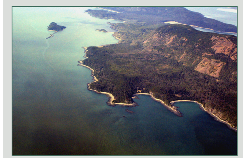
SE08-01-02 Looking northeast over Kalhagu Cove.