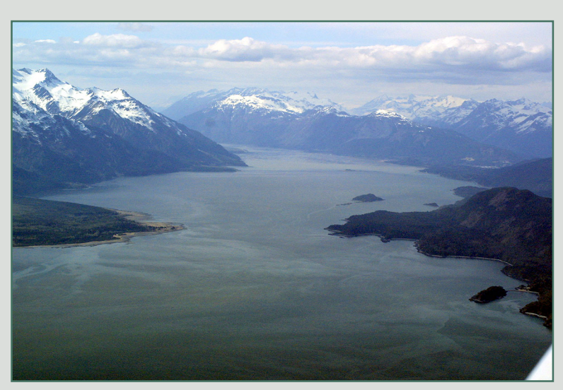
SE08-01 Looking northwest into the Chilkat Inlet.