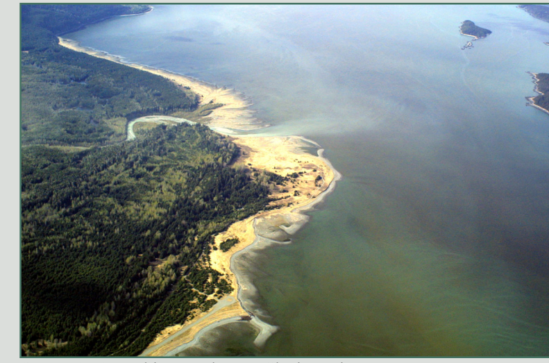
SE08-01-03 Looking north over Glacier Point.