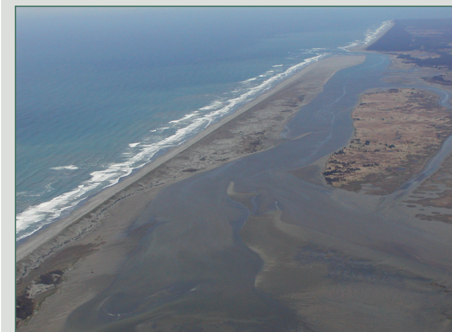
SE09-03 Looking northwest out of Situk River lagoon..