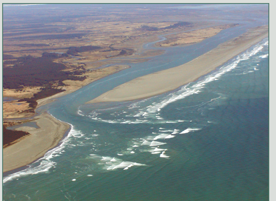
SE09-03 Looking east across Blacksand Spit at Lost River and Situk River.

Free-oil Containment and Recovery, Shallow Water