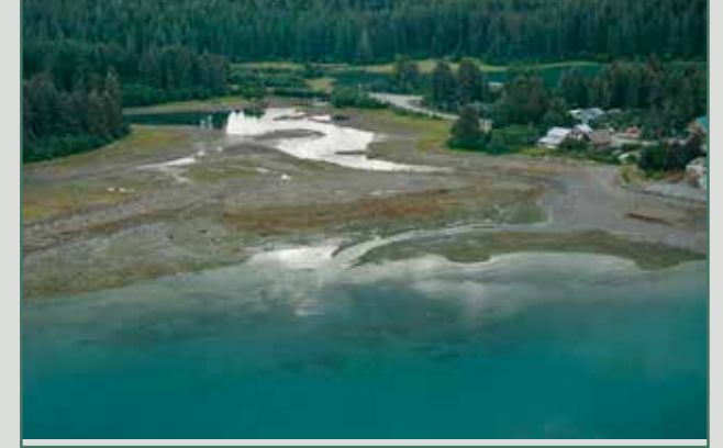
EX01a viewed from the northwest.