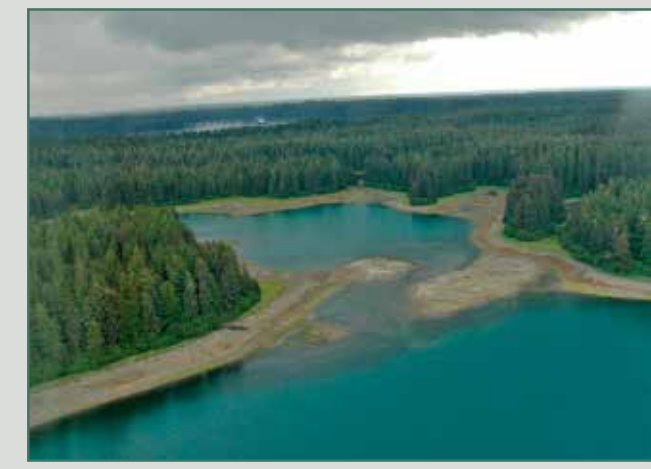
EX01a viewed from the northwest.