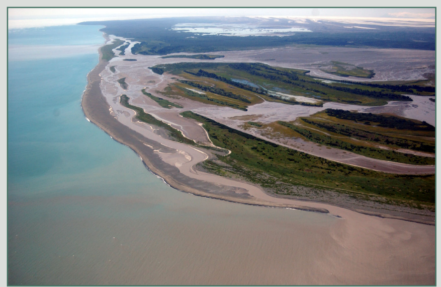
SE09-02 Blizhni Point looking southwest.