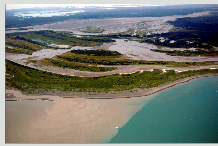
SE09-02 Blizhni Point Looking west.