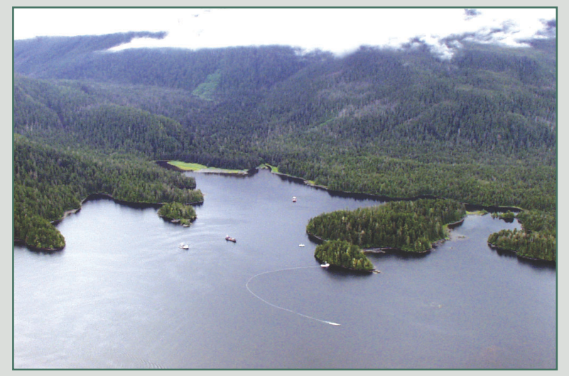
SE05-02 Sandy Cove looking towards the south. Note fishing vessels in photograph.

Free-oil Containment and Recovery, Shallow Water