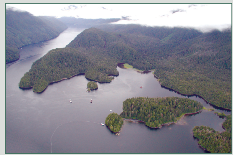
SE05-02 Sandy Cove looking towards the southeast.