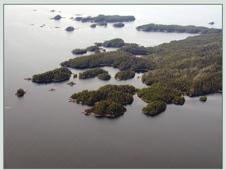
SE05-11 Middle Island looking towards the east.