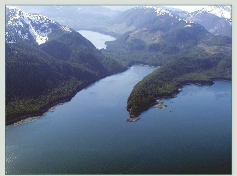
SE05-12 Looking northwest into Basket Bay.