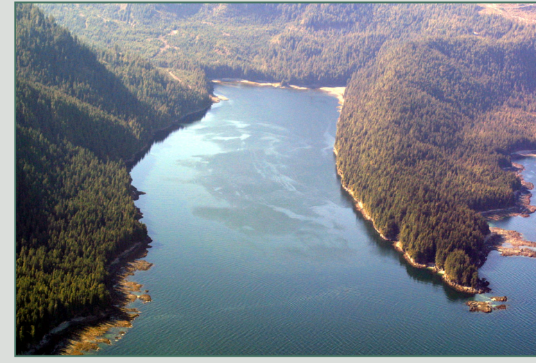
SE05-12 Looking northwest into Basket Bay.