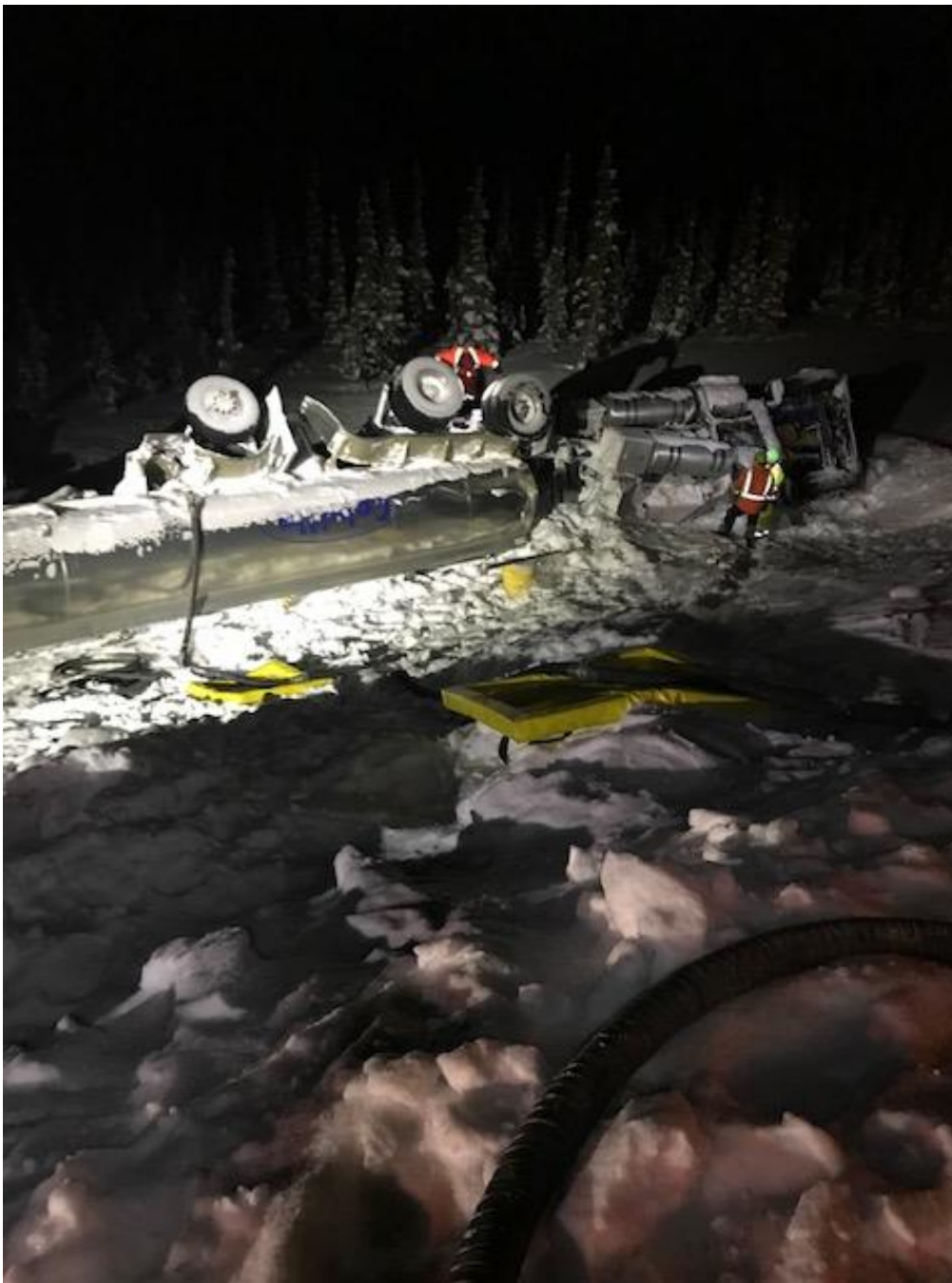
Photo 3: Site of the truck rollover incident (Photo provided by Colville).

AGENCY/STAKEHOLDER NOTIFICATION LIST: Please refer to the first SITREP, distributed February 13, 2019 for the agency/stakeholder notification list. The first SITREP can be found by following the link in the Additional Information box above.