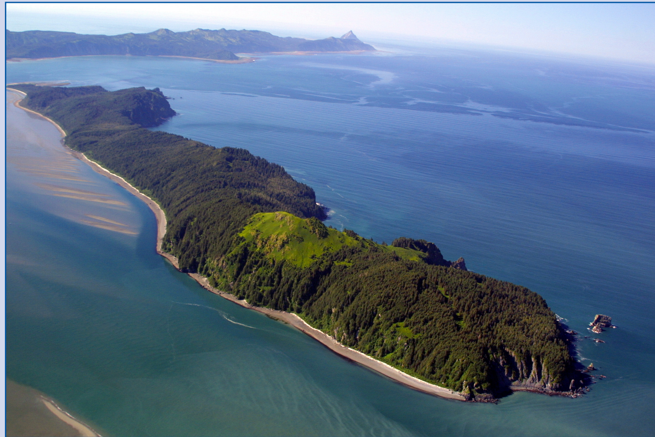
Looking southwest towards Wingham Island.