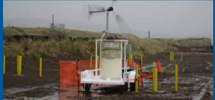
Figure 3. Portable wind turbine used at a remote Navy site in Adak, Alaska

It should be acknowledged that the capital cost of a renewable energy system is sometimes high in comparison to the savings in energy consumption but the economics can be improved if it is integrated with the installation's energy strategy or for remote sites where the cost of bringing in electric power lines is expensive. An example of this is where a portable wind turbine was used to power remediation equipment at a remote Navy site in Adak, Alaska (Figure 3).