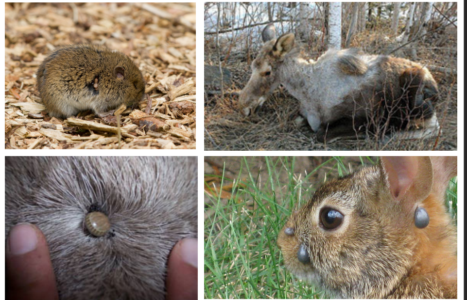
Examples of ticks on wildlife.