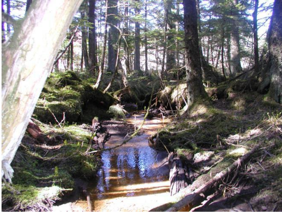
Figure 4. Pederson Hill Creek at site PHC-3, near the intersection of Glacier Highway and Engineers Cutoff Road; site accessible on the nature trail footpath. May, 2006.