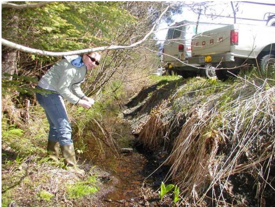
Figure 5. Pederson Hill Creek at site PHC-5, flowing along the edge of the parking lot for the office buildings on Sherwood Lane. May, 2006.