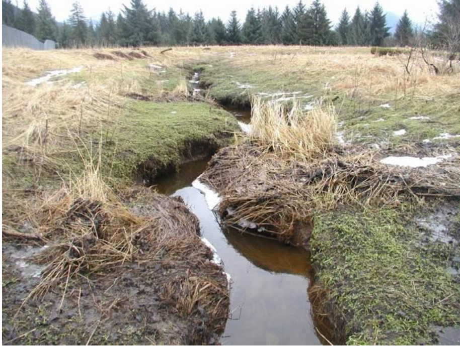
Figure 6. Pederson Hill Creek- Downstream view from the footbridge at PHC-6. February, 2006.

Sampling occurred 3 times between November, 2005 and May, 2006. A November (11/5/05) collection represented fall high flow conditions; a February sample (on 2/20/2006) represented winter conditions, and a May sample (on 5/15/2006) represented late spring conditions.