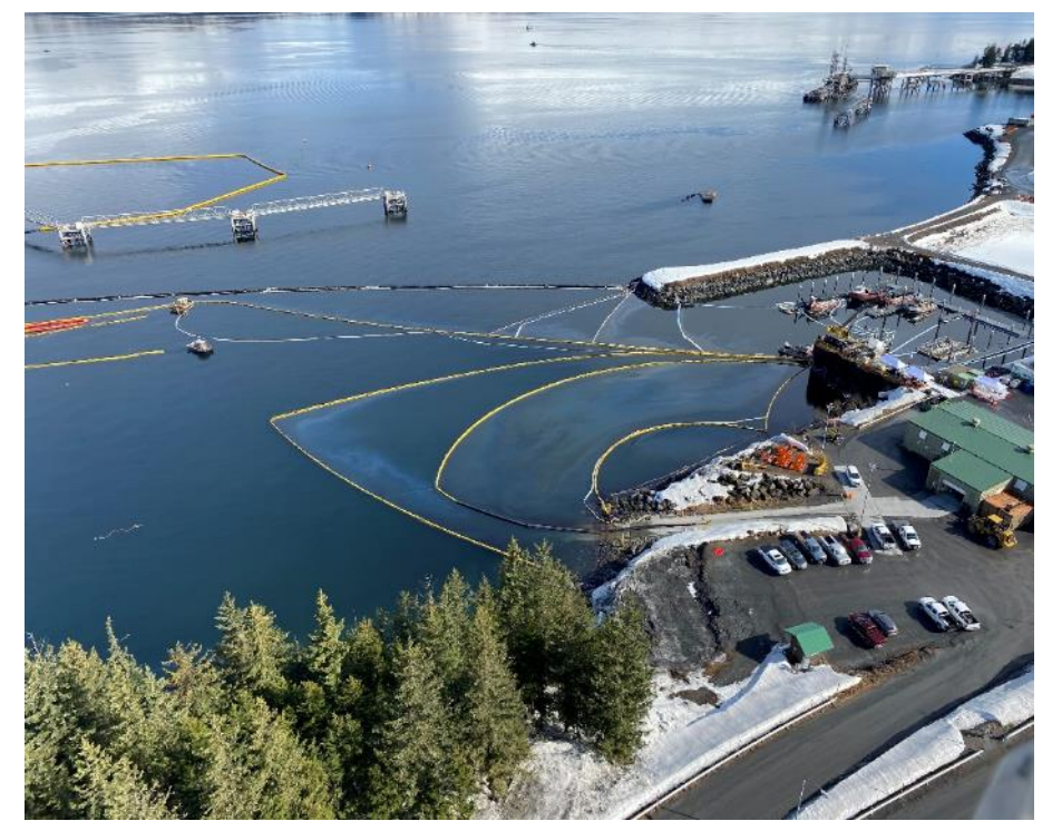
Figure 2. Overhead photo of the VMT Small Boat Harbor looking East April 16, 2020.