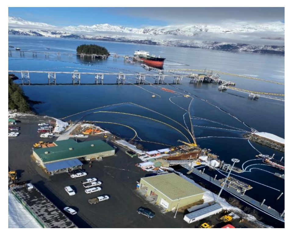
Figure 3. Overhead photo of the VMT Small Boat Harbor looking West April 16, 2020.

AGENCY/STAKEHOLDER NOTIFICATION LIST: Please refer to the first SITREP, distributed April 13, 2020, for the agency/stakeholder notification list. The first SITREP can be found by following the link in the Additional Information box above.