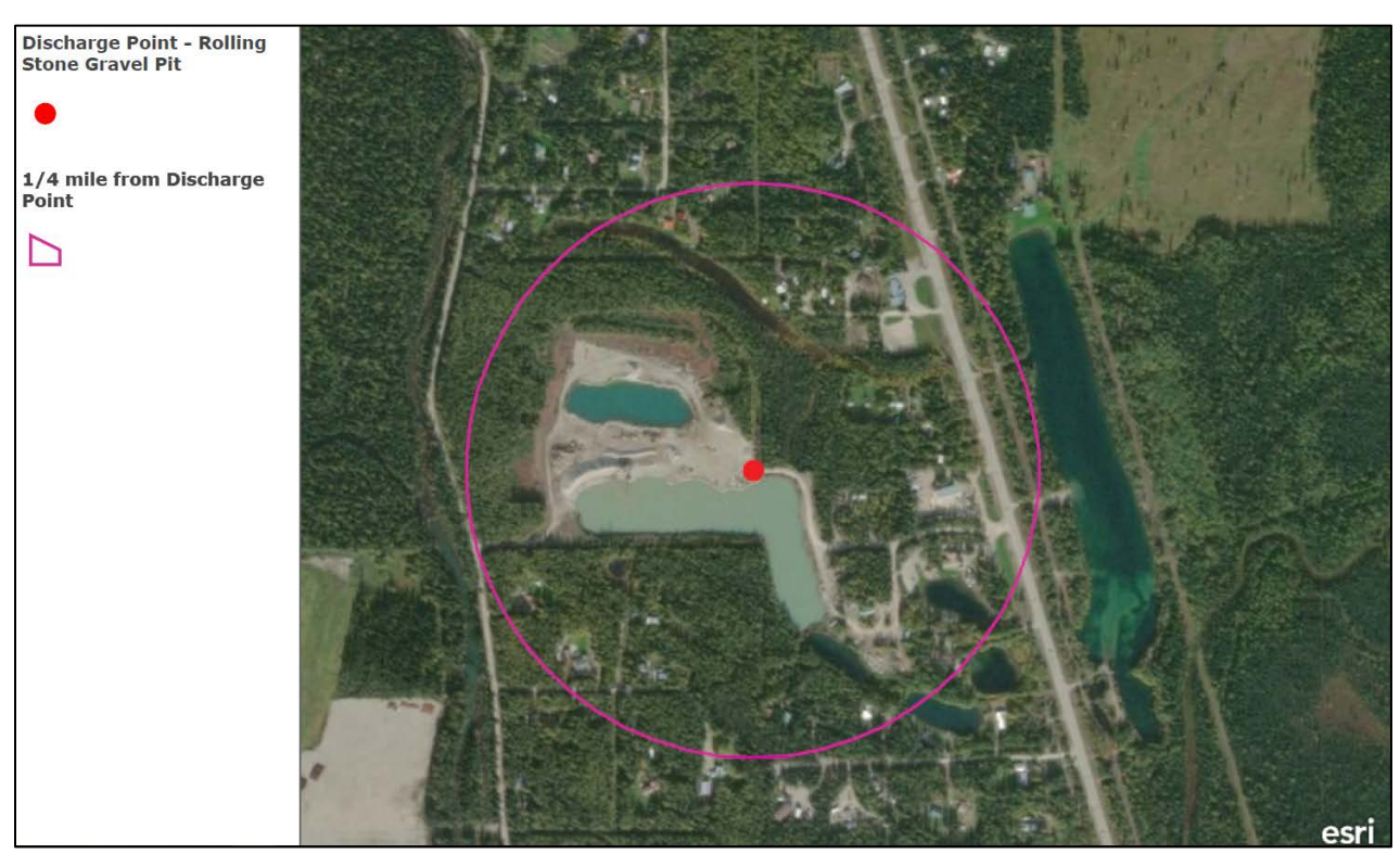
FIGURE 1: Salcha Pit location at 6665 Richardson highway. The red dot indicates the approximate location of discharge. Basemap imagery provided by ESRI. Figure by ADEC.