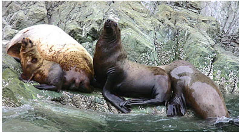
Steller sea lion