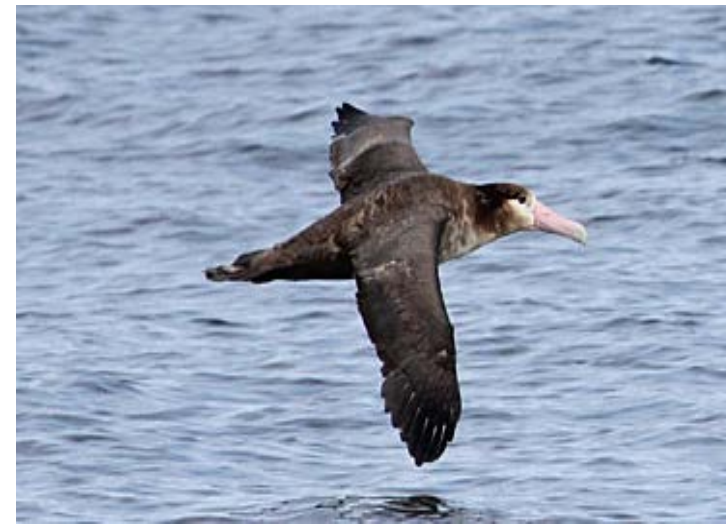
Short-tailed Albatross (sub-adult)