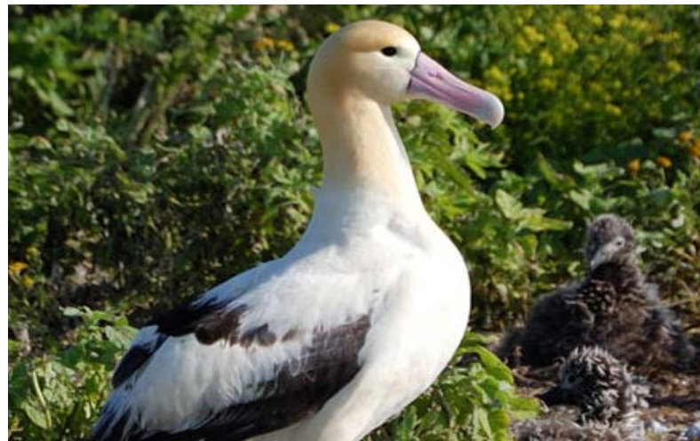
Short-tailed Albatross (adult and chicks)