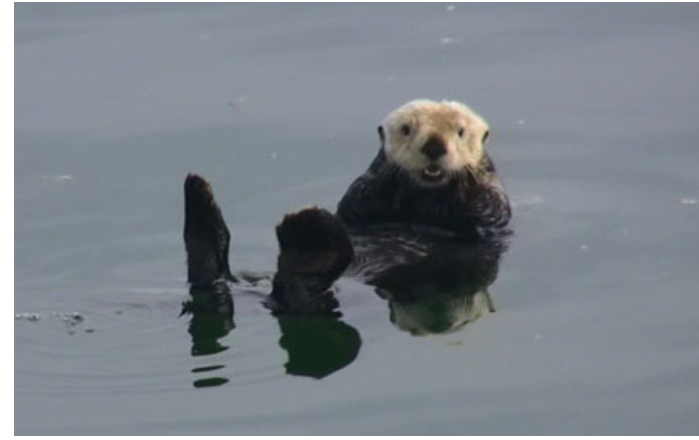
northern sea otter