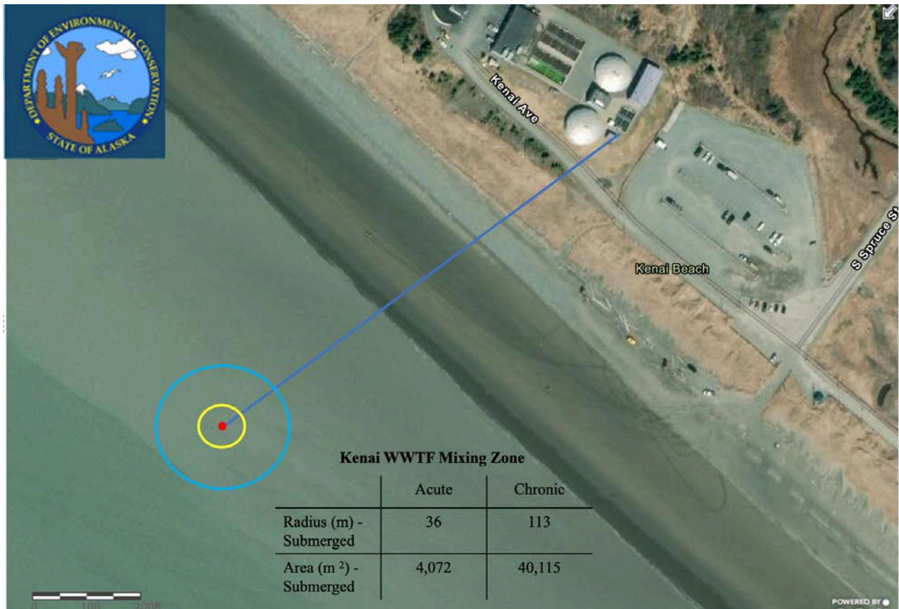
Figure 4: Kenai Wastewater Treatment Facility Submerged Chronic and Acute Mixing Zones

According to EPA (1991) and 18 AAC 70.240, lethality to passing organisms would not be expected if an organism passing through the plume along the path of maximum exposure is not exposed to concentrations exceeding the acute criteria when averaged over a one-hour time period. Furthermore, the travel time of an organism drifting through the acute mixing zone must be less than approximately 15 minutes if a one-hour exposure is not to exceed the acute criterion. DEC determined that the travel time of an organism drifting through the acute mixing zone to be approximately 4.6 minutes; therefore, there will be no lethality to organisms passing through the acute mixing zone.