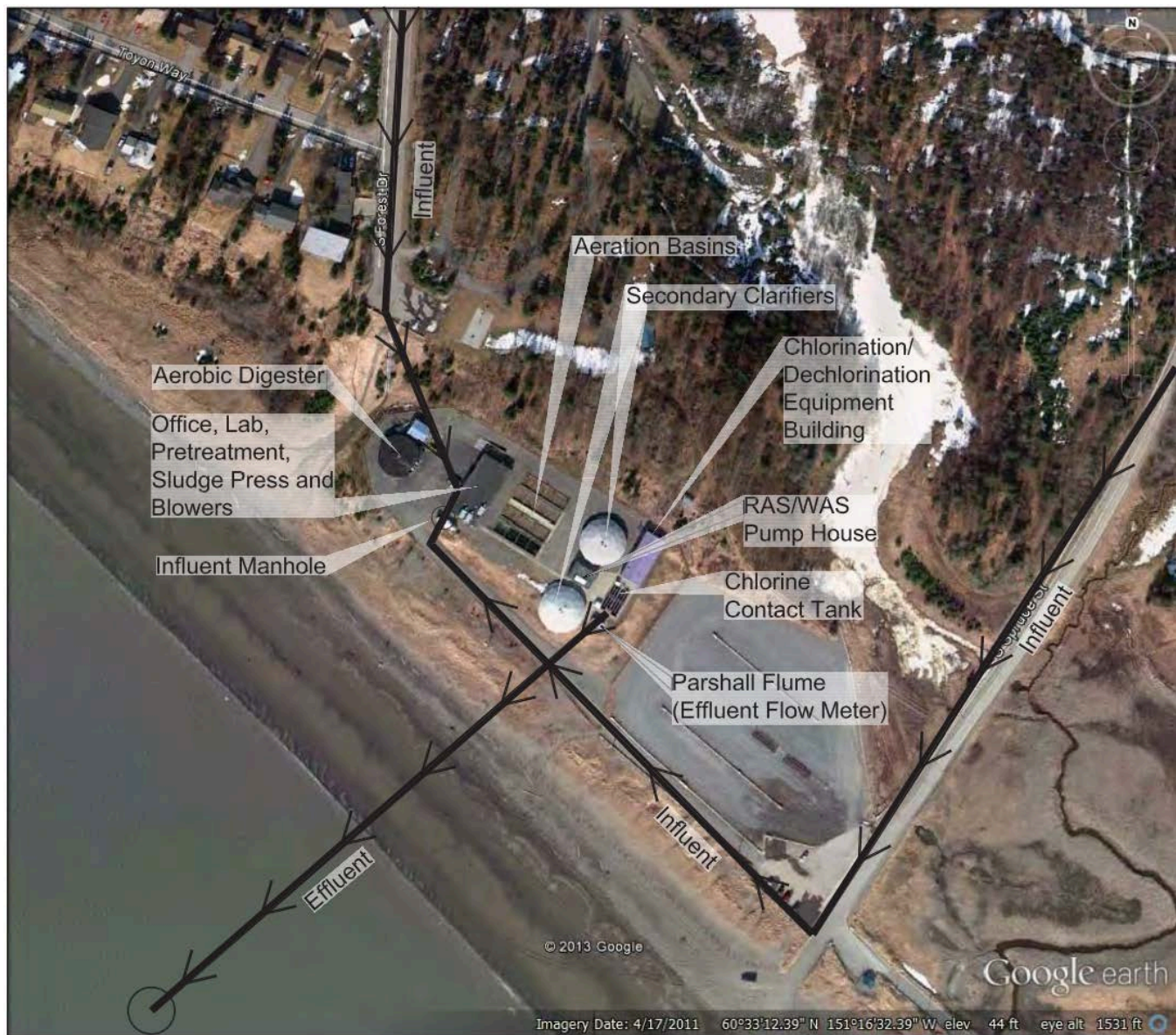
Figure 1: Kenai Wastewater Treatment Facility Vicinity Map

Since the previous APDES permit issuance, major modifications to the facility include: an aeration basin blower replacement and an additional dissolved oxygen (DO) analyzer installed in November 2019. A Waste Activated Sludge (WAS) Pump replacement was installed in 2020. More information about recent upgrades to the Kenai WWTF can be found in Fact Sheet Part 3.3. Figure 1 shows a map of the location of the Kenai WWTF and Figure 2 is a schematic of the facility's process flow system.