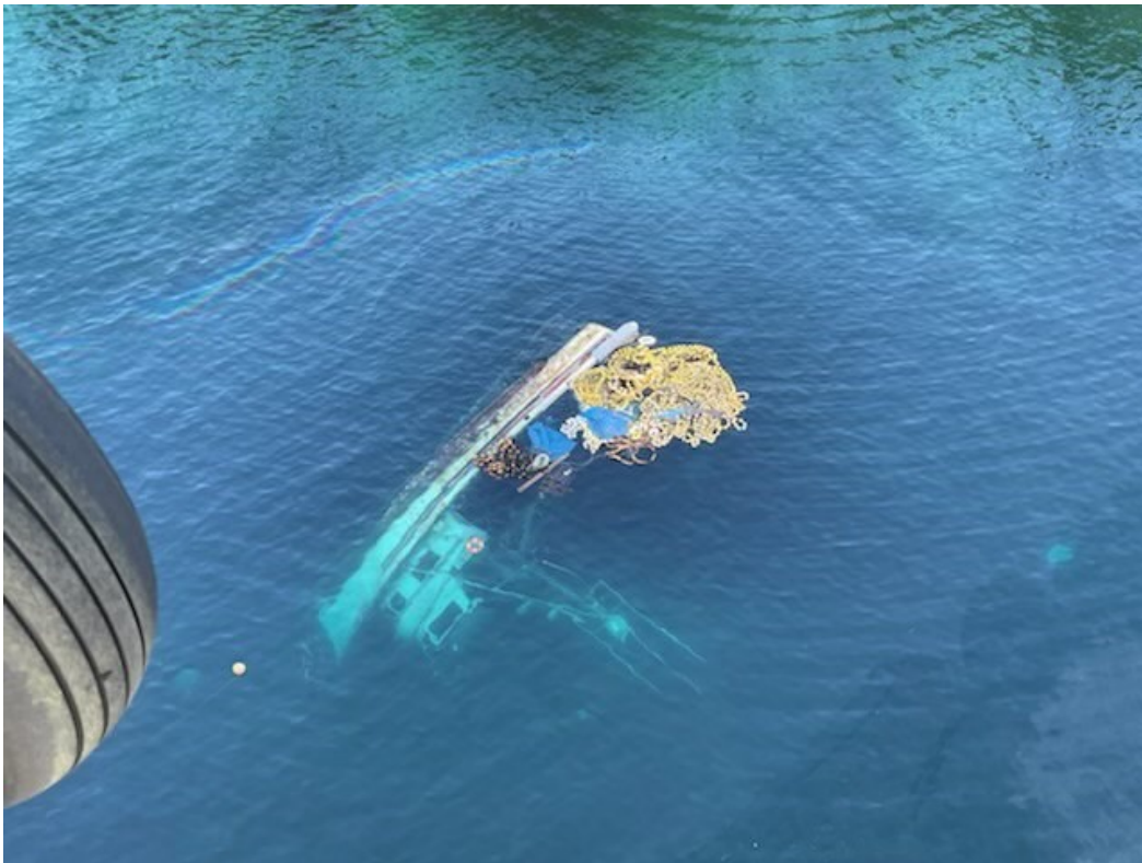
Figure 1. Vessel condition on February 26, 2021 as seen from USCG overflight.

[https://dec.alaska.gov/spar/ppr/spill-information/response/]