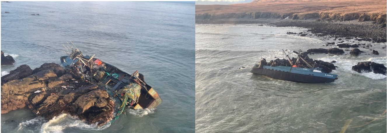
Nov 1, 2021 Vessel Aground on Sitkaldik Island, AK.

AGENCY/STAKEHOLDER NOTIFICATION LIST: This situation report was distributed to the agencies listed on the standard distribution list, which includes the governor’s office, State Emergency Operations Center, U.S. Department of the Interior, National Marine Fisheries Service, U.S. Fish and Wildlife Service, and other state agencies. This situation report was also distributed to the following agencies and stakeholders: