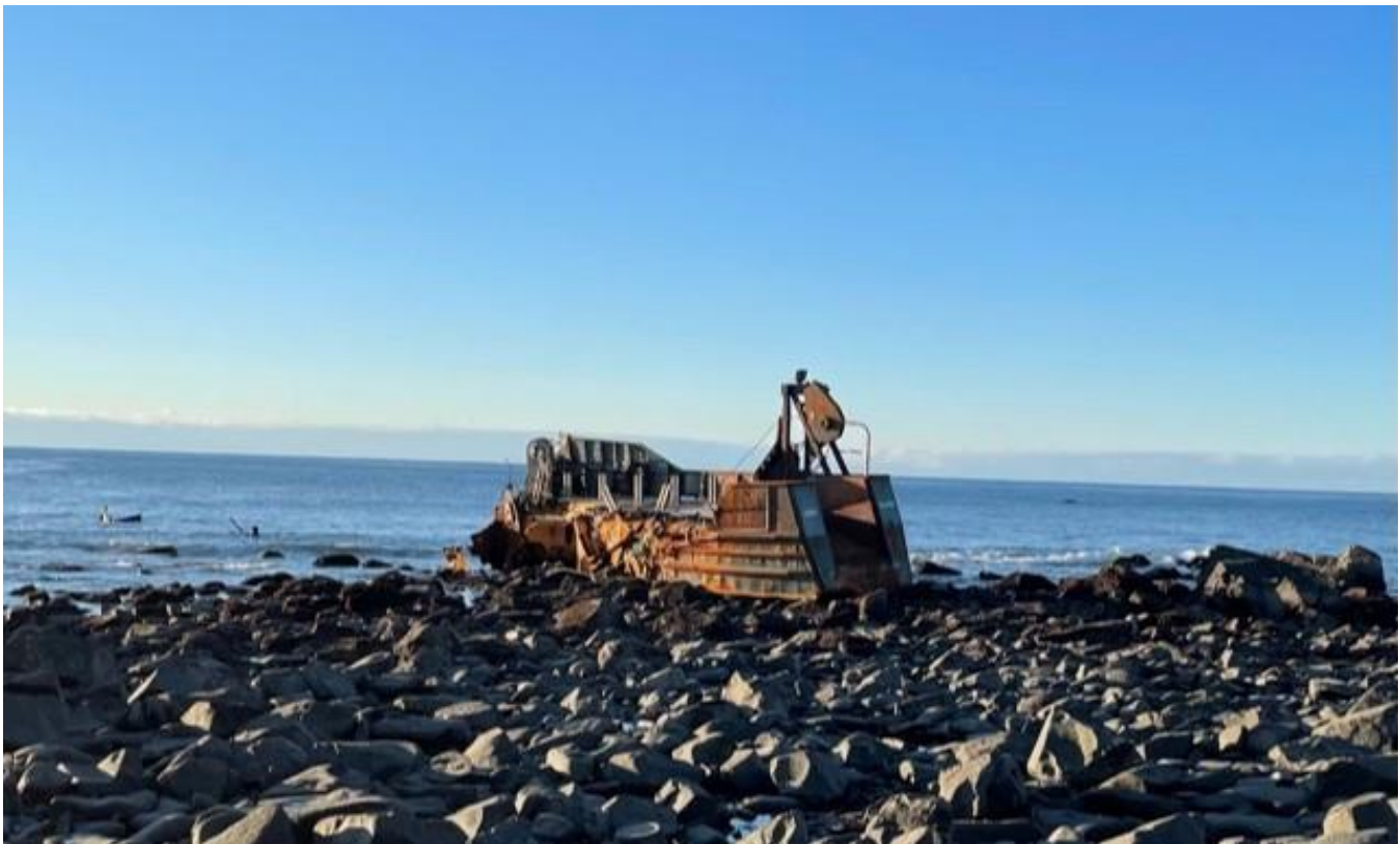
Vessel Stern Aground on Sitkalidak Island, AK.

AGENCY/STAKEHOLDER NOTIFICATION LIST: This situation report was distributed to the agencies listed on the standard distribution list, which includes the governor's office, State Emergency Operations Center, U.S. Department of the Interior, National Marine Fisheries Service, U.S. Fish and Wildlife Service, and other state agencies. This situation report was also distributed to the following agencies and stakeholders: