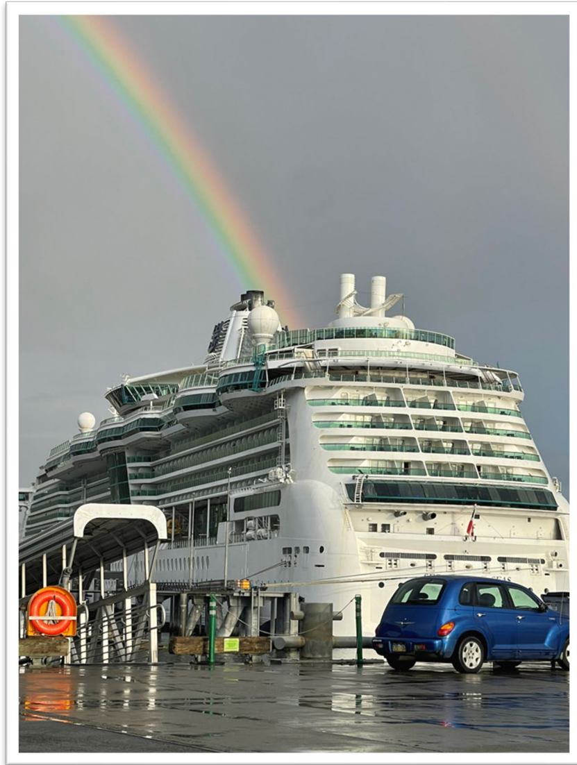
Royal Caribbean Cruises Serenade of the Seas docked in Ketchikan August 28, 2021

This report is prepared annually by the Alaska Department of Environmental Conservation (ADEC) Division of Air Quality, Compliance Program (AQ Program). The intent of this report is to provide information on the air quality monitoring and compliance efforts with cruise ship and state ferries air pollution.