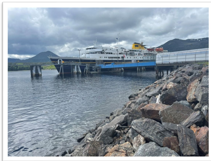
Alaska Marine Highway System M/V Matanuska docked in Ketchikan June 7, 2021