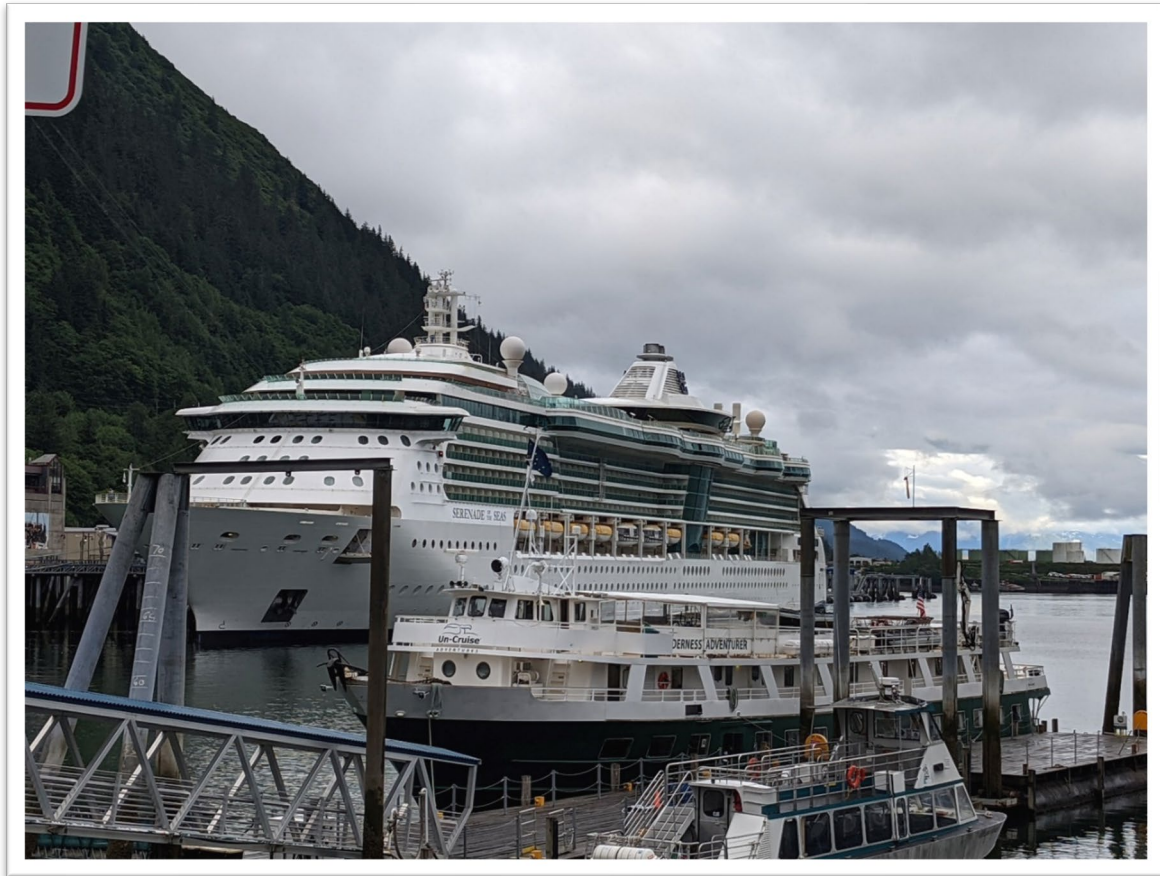
Un-Cruise Wilderness Adventurer and Royal Caribbean Cruises Serenade of the Seas docked in Juneau July 23, 2021