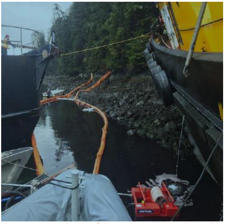
Figure 3. Water-side view of skimmer recovering product within primary containment boom as seen on March 23<sup>rd</sup>.