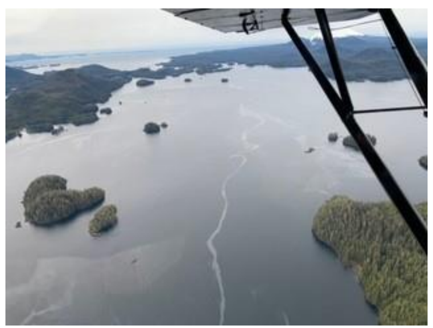
Figure 2. Observed sheening ribbons on the north end of Krestof Sound extending south toward Magoun Islands as seen around 8:30 a.m. on March 24<sup>th</sup>.