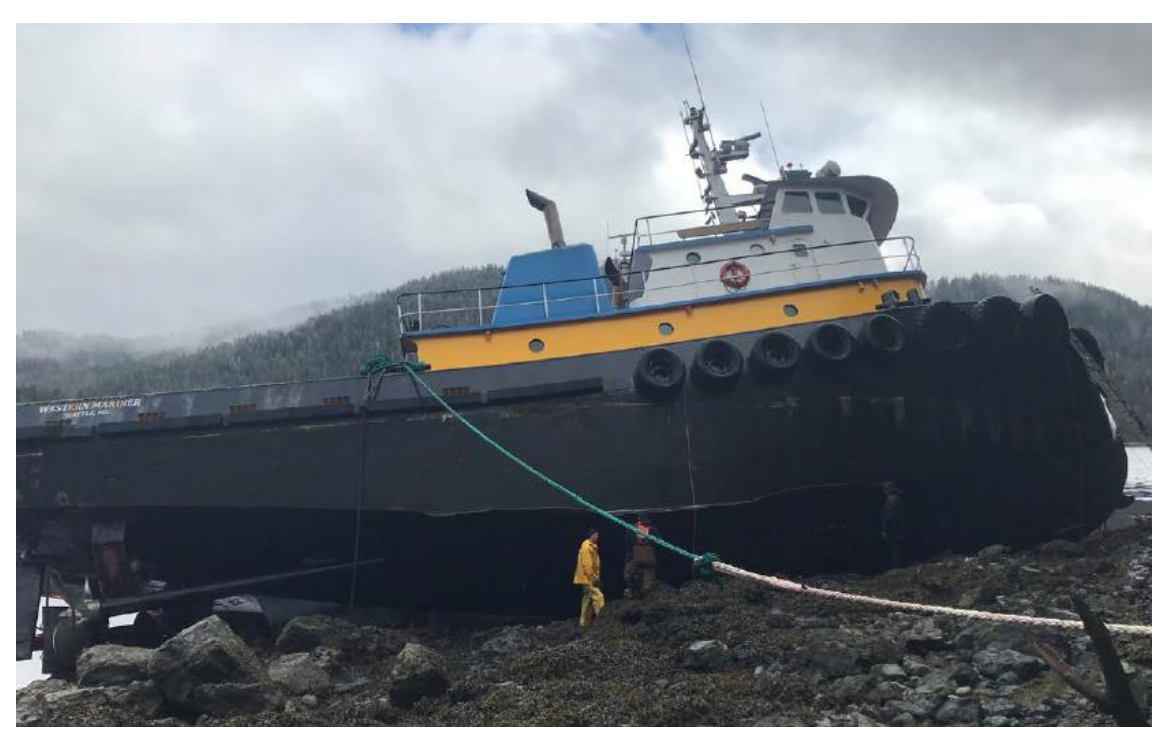
Figure 4. Global Diving and Salvage, Inc. and Western Towboat Co. crew securing through-hull fittings as seen on March 23<sup>rd</sup>.

AGENCY/STAKEHOLDER NOTIFICATION LIST: This situation report was distributed to the agencies listed on the standard distribution list, which includes the governor's office, State Emergency Operations Center, U.S. Department of the Interior, National Marine Fisheries Service, U.S. Fish and Wildlife Service, and other state agencies. This situation report was also distributed to the following agencies and stakeholders: