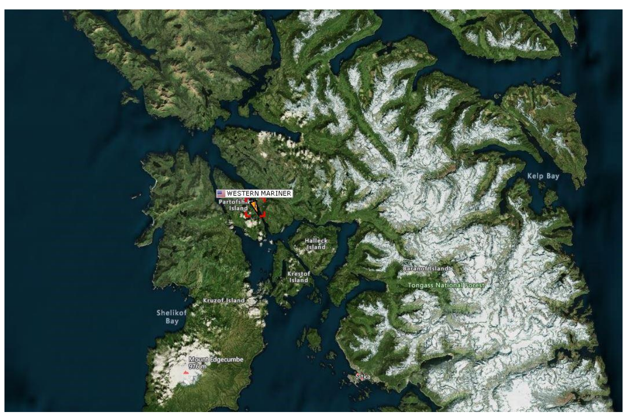
Figure 1. Incident Location.