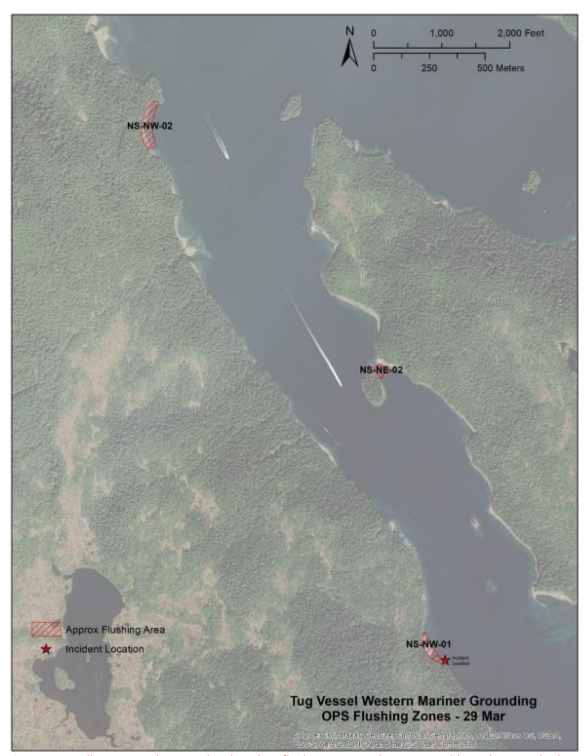
Figure 3. Satellite image showing the shoreline flushing zones. Photo created by Polaris Applied Sciences, Inc. on March 29<sup>th</sup>, 2022.