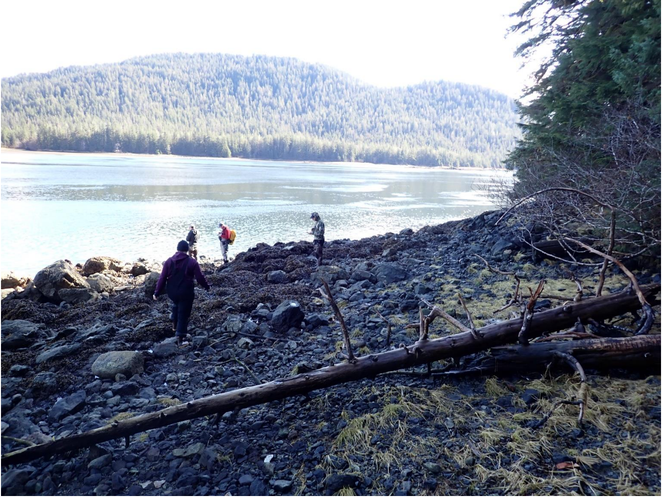
Figure 4. Image of the SCAT Team conducting shoreline surveys in Neva Strait on April 4, 2022.