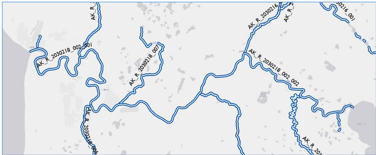
Figure 1 Kenai River assessment units from the mouth upstream to Skilak Lake